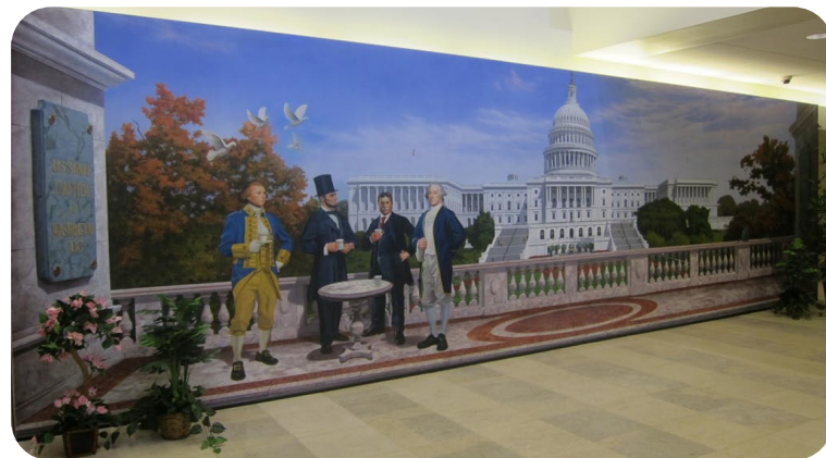
Harmony School of Ingenuity - Houston