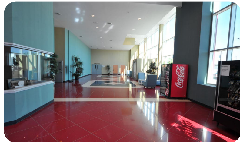
Harmony Public Schools Central Office - Houston