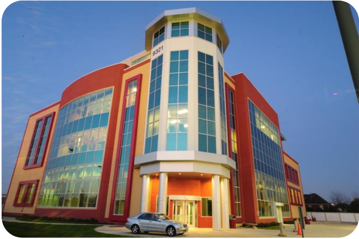
Harmony Science Academy – Houston