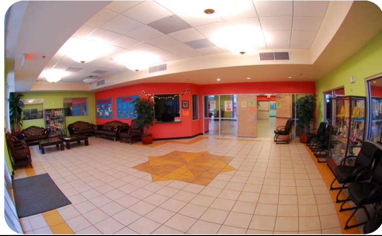
Harmony Science Academy – El Paso