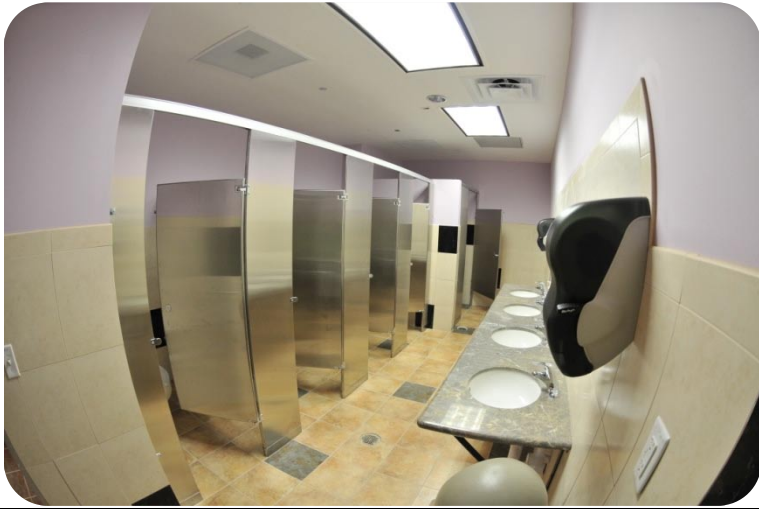
Harmony School of Advancement - Houston