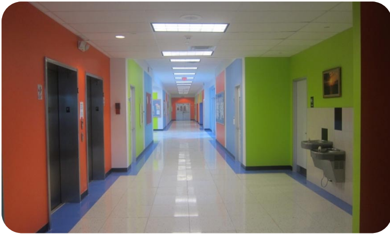
Harmony School of Advancement– Houston