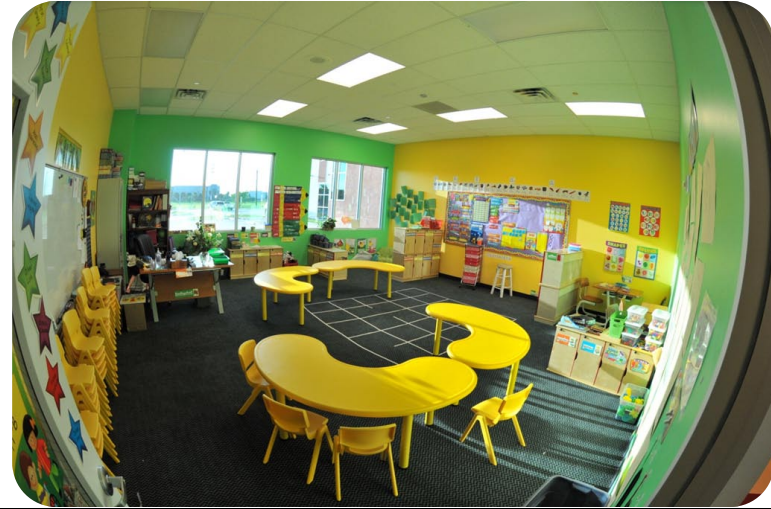
Harmony School of Art – Houston