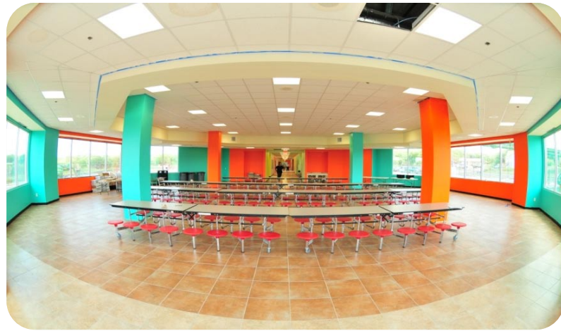
Harmony Science Academy – San Antonio