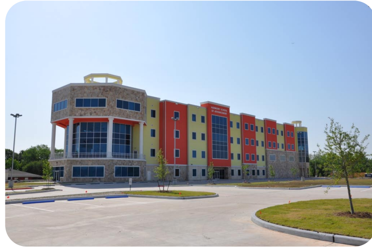
Harmony School of Advancement – Houston