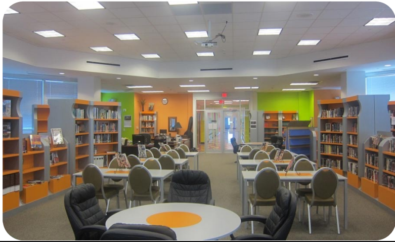
Harmony School of Advancements - Houston