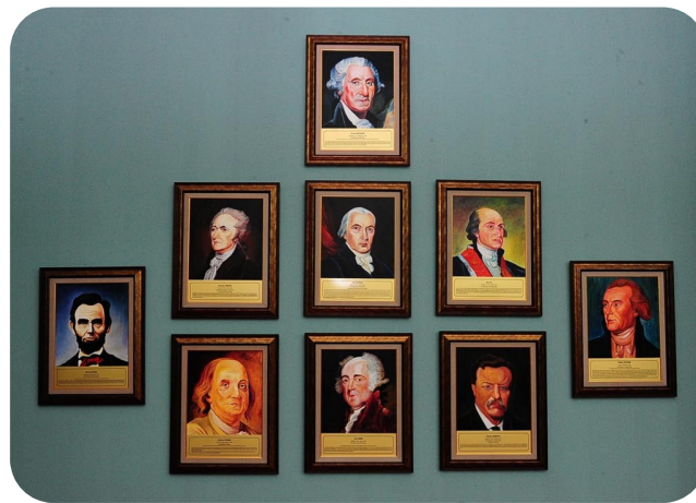
Wall of Founding Fathers – Harmony School of Innovation