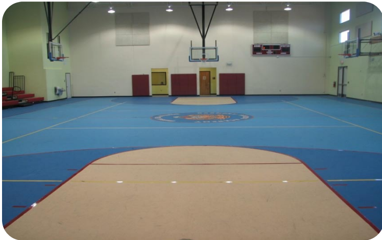
Harmony Science Academy – El Paso