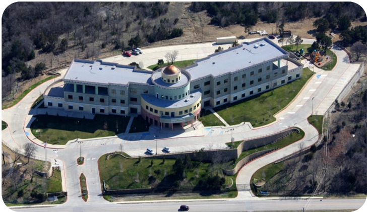
Harmony School of Nature – Dallas