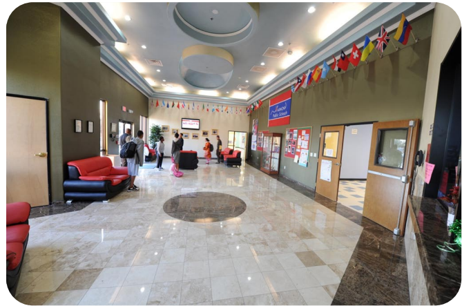
Harmony Science Academy – Austin